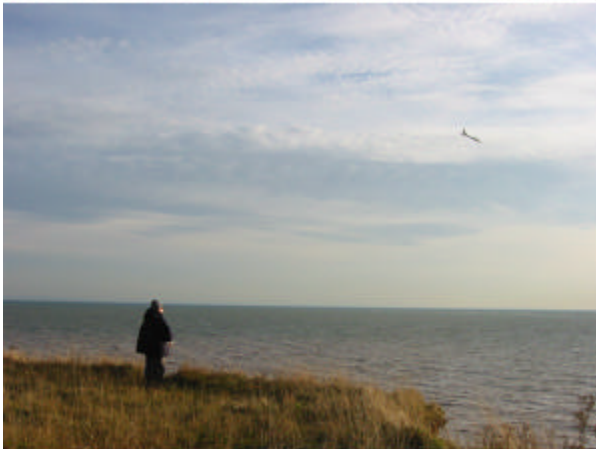
Mohawk Point, November 10, 2004